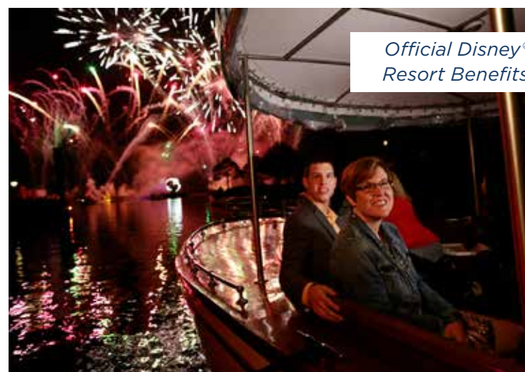
Official Disney® Resort Benefits