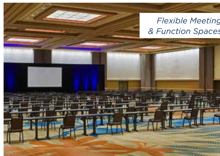
Flexible Meeting & Function Spaces