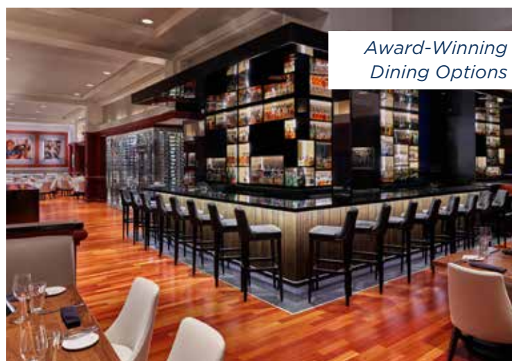
Award-Winning Dining Options